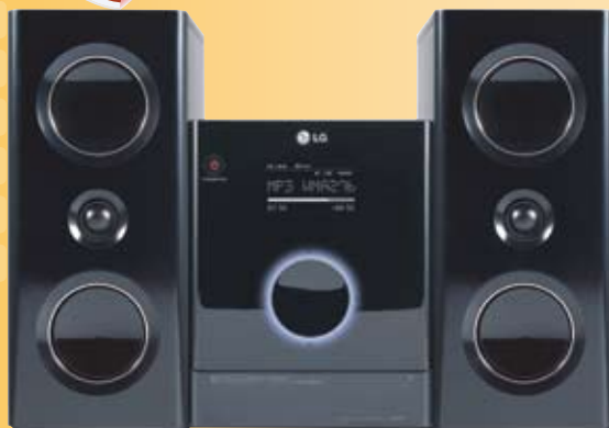
LG CHOCOLATE AUDIO PLAYER (FB163) WORTH $399