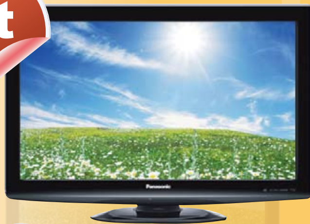
Panasonic 32" LCD (THL32X10) worth $1099